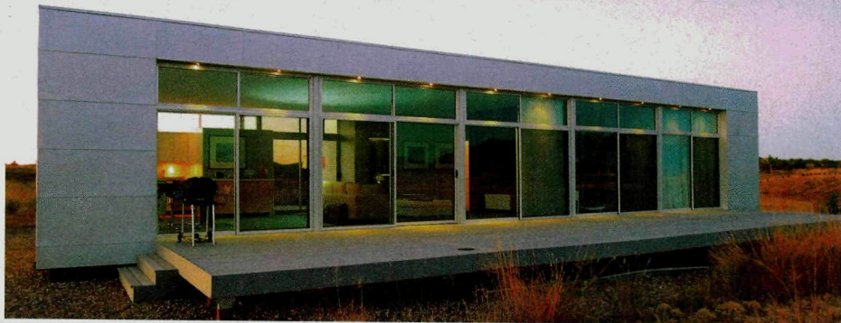
Rocio Romero's sleek modern homes draw nature into the house through walls of glass.