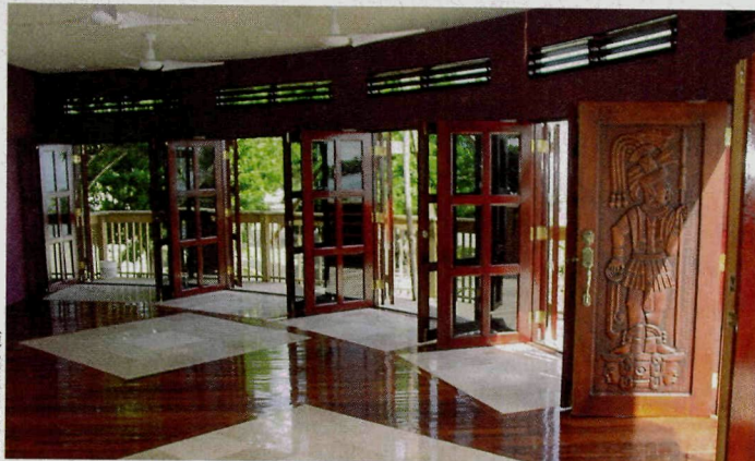
DELTEC HOMES (2)