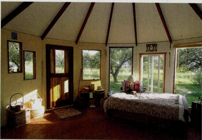
Left: Turtleback Nomadics specializes in wood-framed, yurt-like homes. Right: With no bearing walls, interiors are spacious and airy.