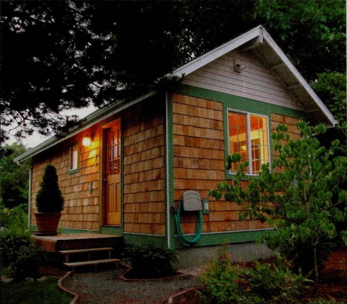
TRUE NORTH LOG HOMES; LEFT: SMALL HOME OREGON; PAGE 37: CUSATO COTTAGES (2)