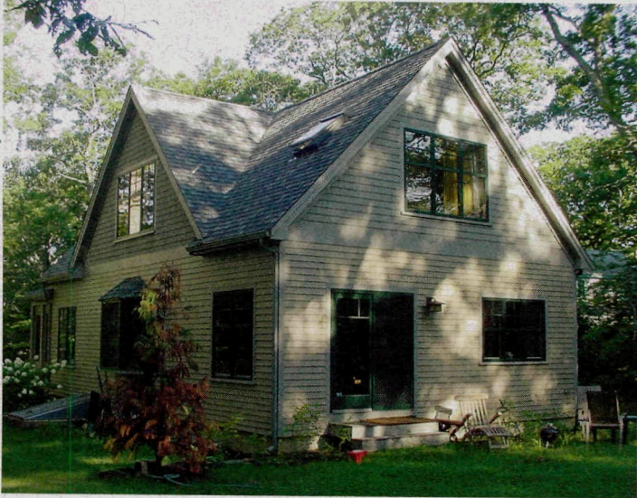
Shelter-Kit's barn homes are designed for beginning DIYers.

probably cost $80 to $200 per square foot." Thus, a 1,500-square-foot house, with no sweat equity from you, could cost $120,000—or $300,000. The figures provided by the companies in our chart on Page 36 range from extremely low to moderately high. Do your homework to find out what's included in your kit.