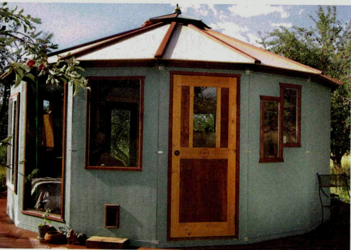
TURTLEBACK NOMADICS (2); ABOVE RIGHT: ROCIO ROMERO