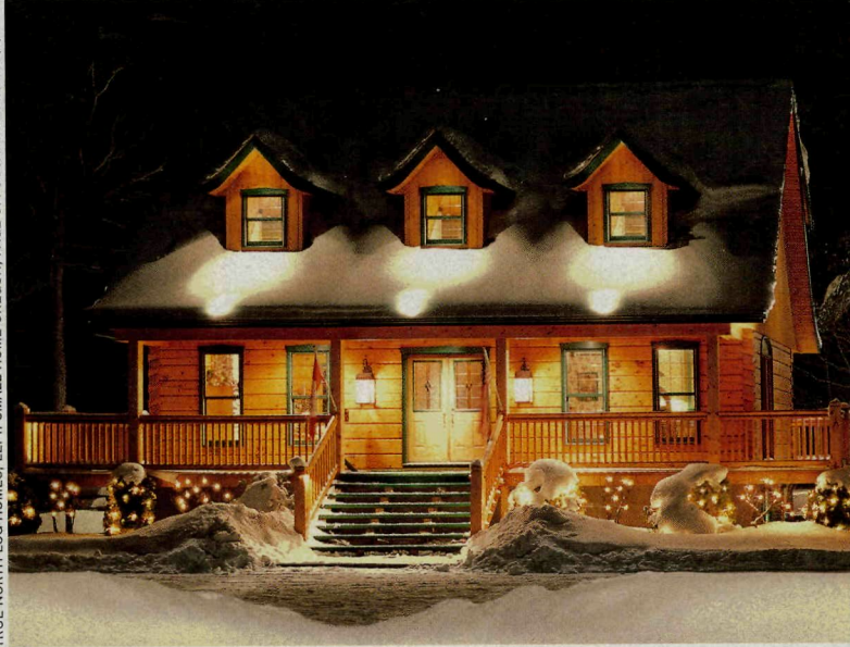
Left: Small Home Oregon's houses meet modular housing codes. Right: True North Log Homes' Louisburg model shows French-Canadian influences.